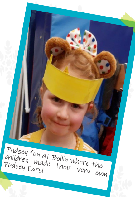
Pudsey fun at Bollin where the children made their very own Pudsey Ears!