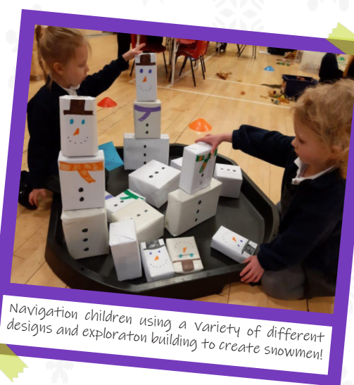
Navigation children using a variety of different designs and exploration building to create snowmen!