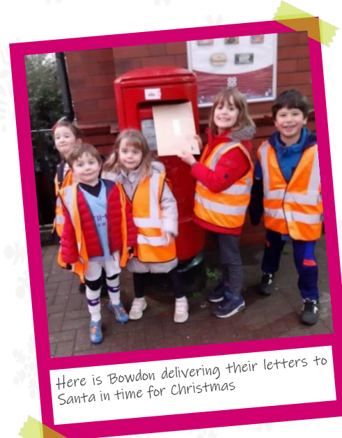
Here is Bowdon delivering their letters to Santa in time for Christmas