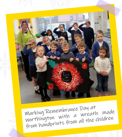
Marking Remembrance Day at Worthington with a wreath made from handprints from all the children