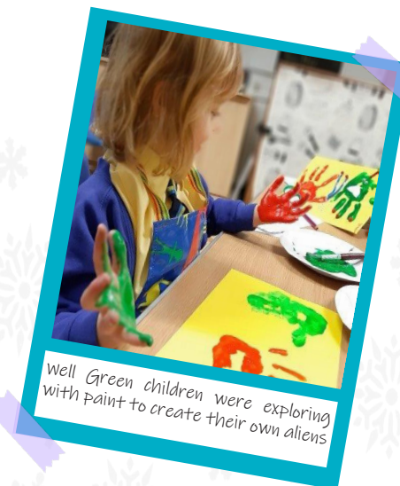
Well Green children were exploring with paint to create their own aliens