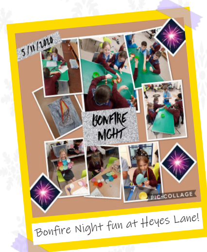
Bonfire Night fun at Heyes Lane!