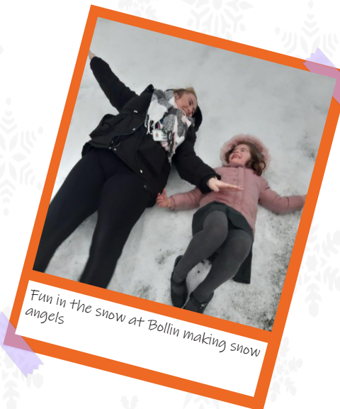
Fun in the snow at Bollin making snow angels