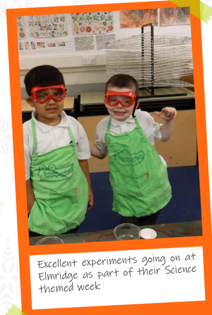
Excellent experiments going on at Elmridge as part of their Science themed week