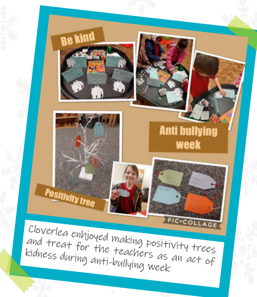
Cloverlea enjoyed making positivity trees and treat for the teachers as an act of kindness during anti-bullying week