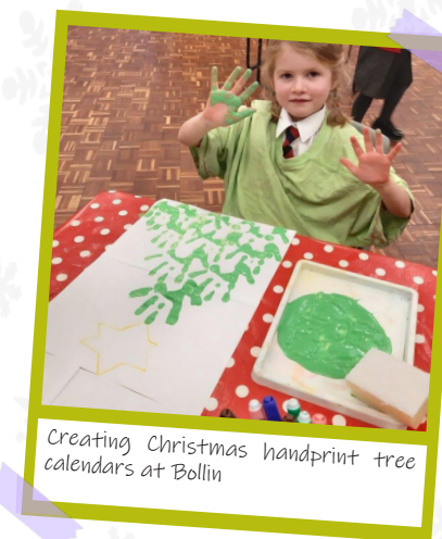
Creating Christmas handprint tree calendars at Bollin