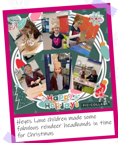
Heyes Lane children made some fabulous reindeer headbands in time for Christmas