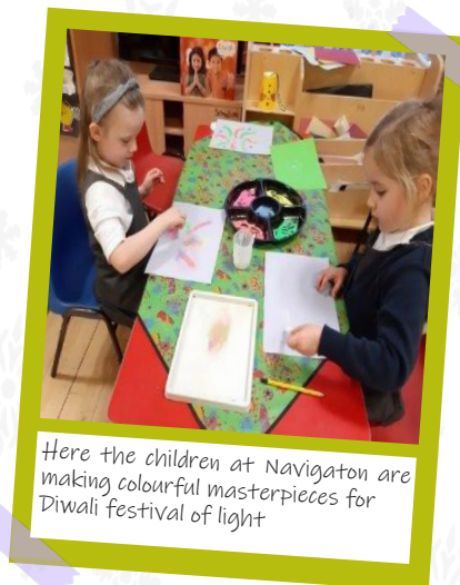
Here the children at Navigation are making colourful masterpieces for Diwali festival of light