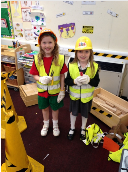
Left: The children at Cloverlea are getting into character in their construction role play area.