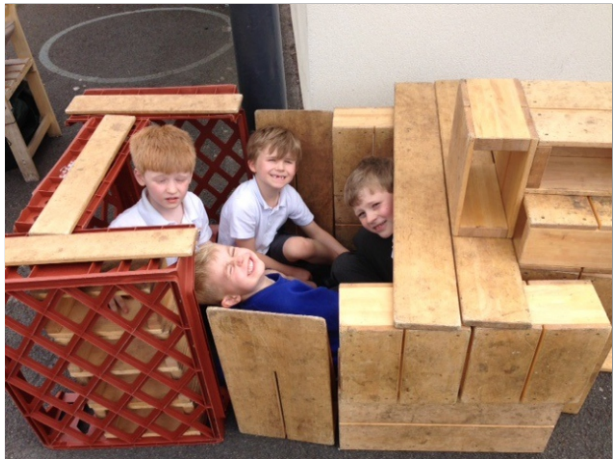
Left: Some inventive outdoor block play by the boys at Worthington.