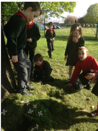
Left: Cloverlea made the most of the sunshine and made a mini beast hotel!