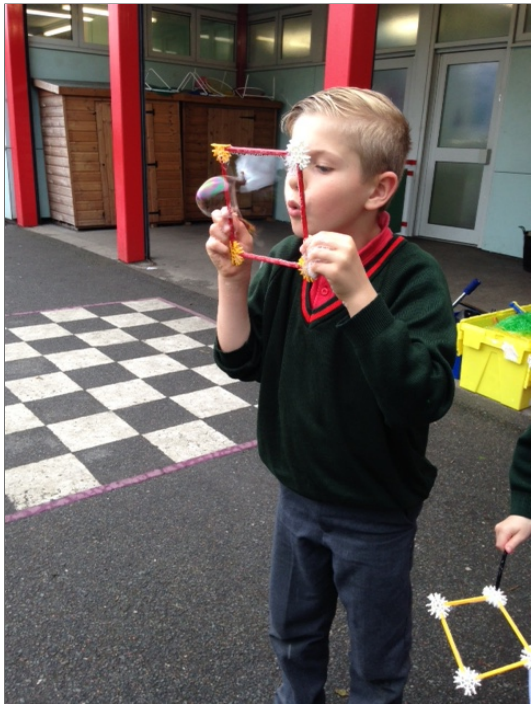
Above: Fantastic bubble makers were created by the children at Cloverlea.