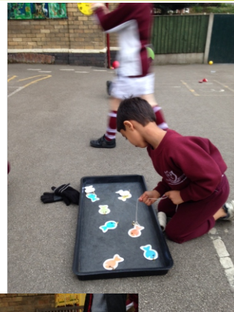
Left & Below: APS made their own games including fishing and a fun fair style coconut shy.