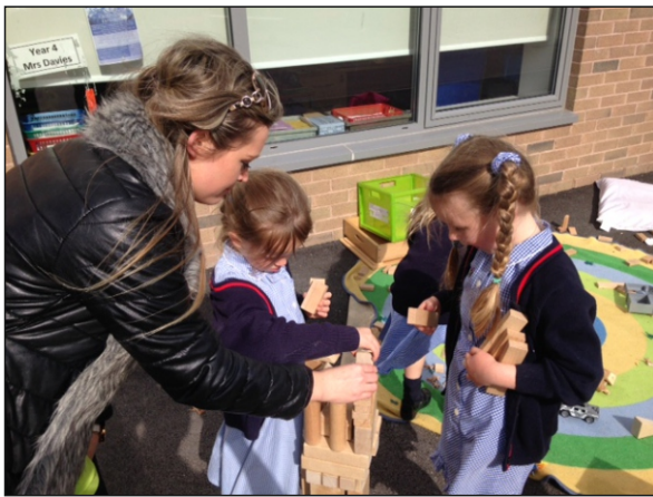
Above: The children at Bowdon make lofty towers with the building bricks.