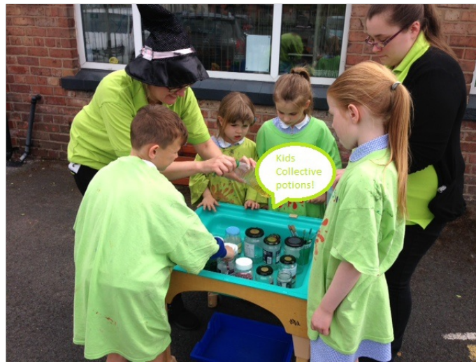
Left: Worthington children having fun experimenting with potions.