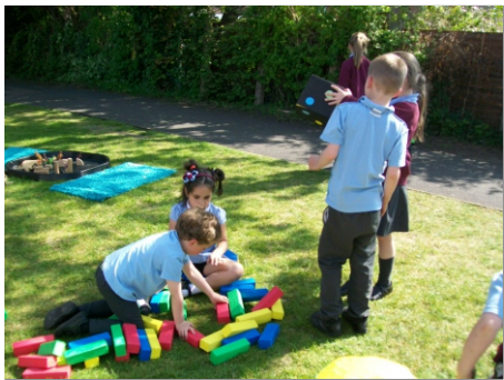
Above: Heyes Lane have been making the most of the warmer weather by bringing their resources outside!