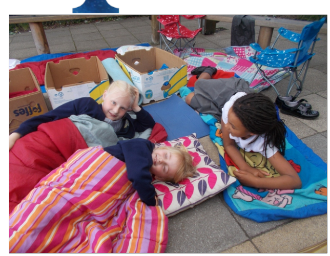
Above: Den making and camping fun at Navigation.