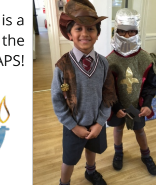
Right: Dressing up is a big hit with the children at APS!