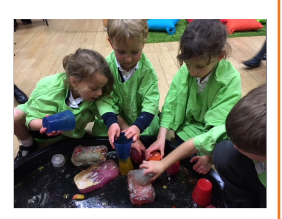
Above: The children at Navigation are absorbed in exploring ice and water.