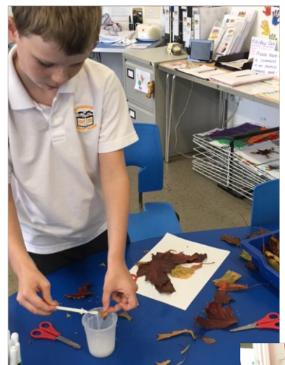
Left: Worthington children make best use of the fallen leaves to create collages.