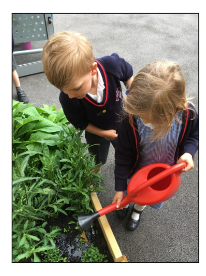
Left: The children at Bowdon take great pride in nurturing and caring for their plants at club.