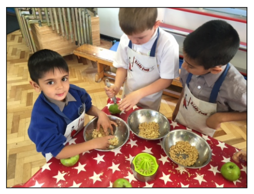
Above: Well Green children enjoying the Kiddycook Workshop. Here they are making apple crumble.