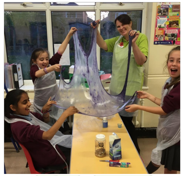
Above: Slime is the activity of the day at Heyes Lane. The children had so much fun!